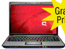
HP Presario V6500Z Series